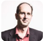
Scott Guthrie EVP Cloud + AI Group Microsoft